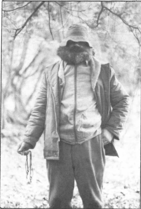
An Unexpropriated Romany Man Holding Rabbit Snares, Worcestershire, Winter 1979

This comes from a somewhat later period but in showing us some of what the Romany knew in order to survive, it can show what others might learn from them. 18