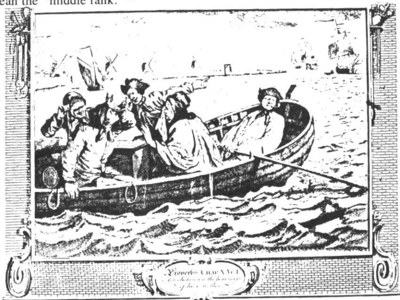
Tom Idle Goes to Sea, An Excerpt from William Hogarth