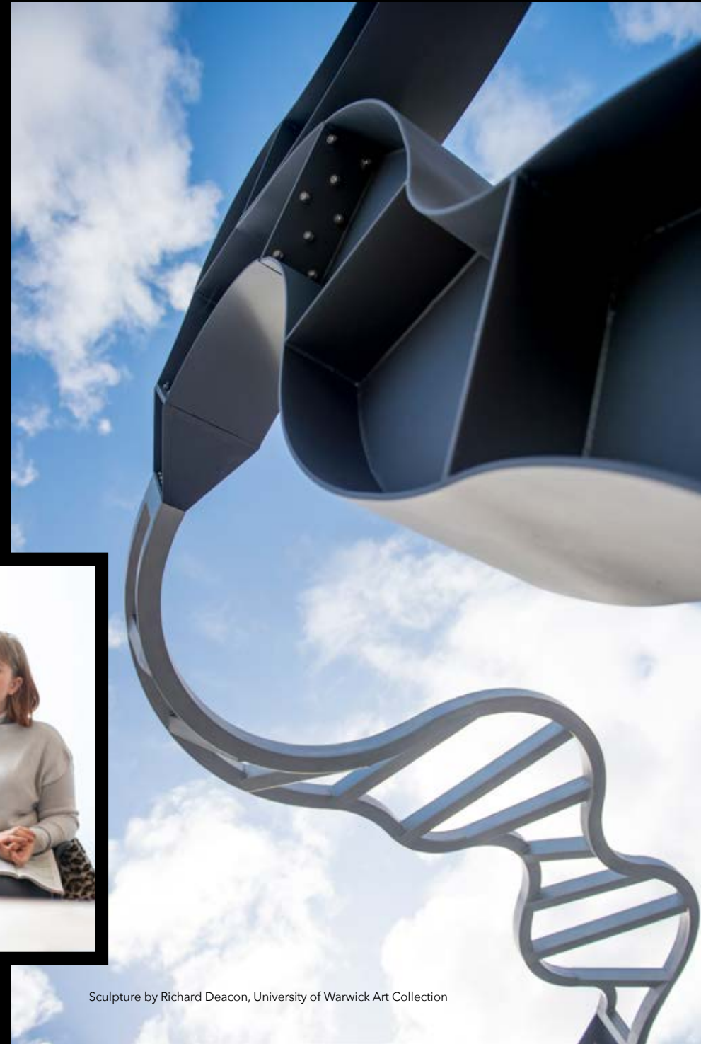
Sculpture by Richard Deacon, University of Warwick Art Collection