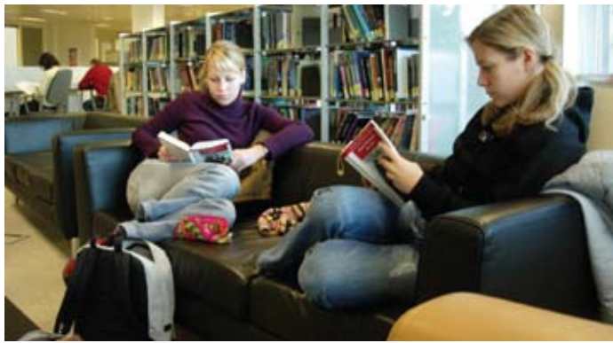
University House: The Learning Grid provides an exciting, innovative, integrated, flexible space that supports students by facilitating independent learning in new and changing ways. Open 24 hours a day, 364 days a year.