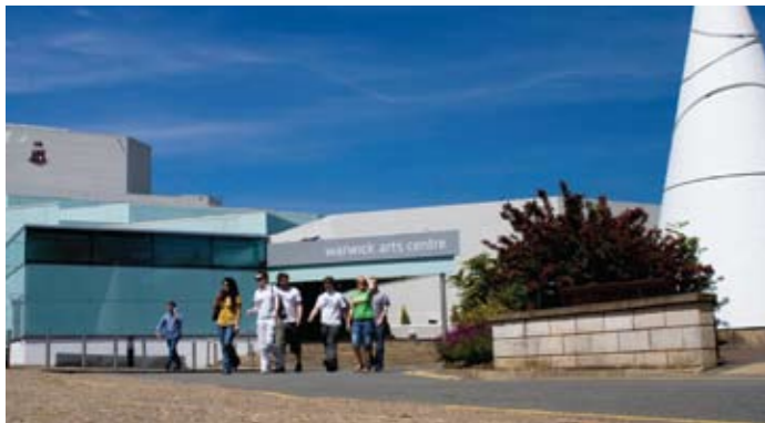
Warwick Arts Centre: One of the largest Arts Centres outside of London. Six outstanding venues on the same site – a concert hall, two theatres, a cinema, gallery, conference room as well as hospitality suites, a restaurant, cafe, shops, and two bars.