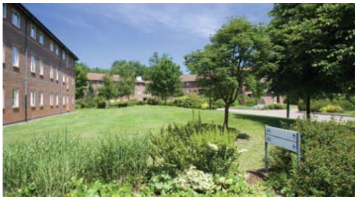
Warwick Accommodation: The University is dedicated to managing students' accommodation requirements both on and off campus. Over 5,700 campus rooms and more than 1,500 off-campus rooms in Leamington Spa and Coventry.