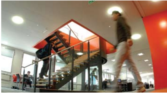
The Library: Open Mon-Sun 8.30am-12am, times vary during vacation periods. One million printed volumes and 10 km of archives in its main building and Modern Records Centre.