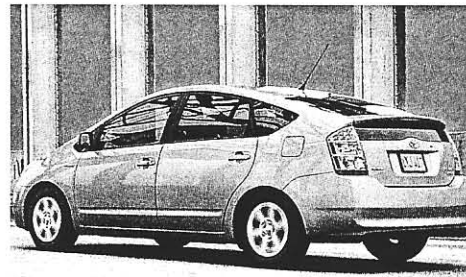
A representative of Toyota, maker of the Prius hybrid car, said: "Take action now."

Currently, mechanical properties – such as impact performance and heat distortion temperature